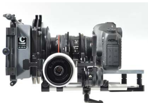
Fluid Zoom Drive mounted on lightweight support, incl. further Chrosziel accessories on Canon EOS 5D MK II

To mount your Fluid zoom drive, use a rodsystem with 15mm. Please choose the suitable lightweight support for your camera.