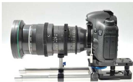
Lens support bracket 401-33 mounted on 15mm lightweight support rods to release the lens mount of your camera.