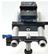
401-33 (on LWS 401-421S) Lens support with reverse lock nut screw. With the 5mm pivot of the screw the tripod connection of tele lens can be used to support the lens.