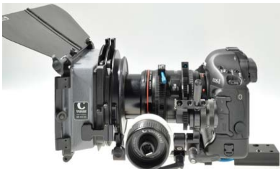
MatteBox 450-R20 with 450-20 Flexi-Insertring, mounted on 401-93 lightweight support on Canon EOS 1D camera.

MatteBoxen and SunShades allow the use of glass filters. They improve picture quality because they prevent from stray light. Lenses with tube or rotating front element can only be used with restrictions.