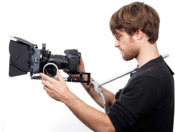
Use the 3025 DV-Balancer® for handheld shots from the shoulder. Fits directly on the LWS or with 1/4" screw.