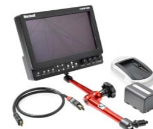
550-01 MonitorPack delivery range