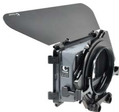
450-R10 MatteBox with 1 filterstage