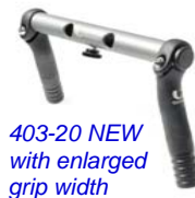
403-20 NEW with enlarged grip width

403-10 und 403-20 proVideo handle bar is an additional carrying version to mount on 15mm LWS lightweight support rods.