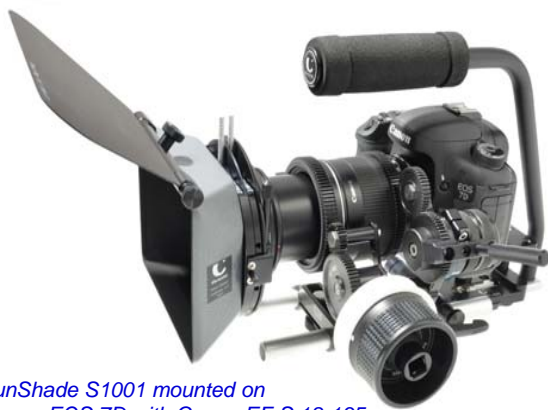
SunShade S1001 mounted on Canon EOS 7D with Canon EF-S 18-135mm

To mount your MatteBox system, use a rodsystem with 15mm. Please choose the suitable lightweight support for your camera.