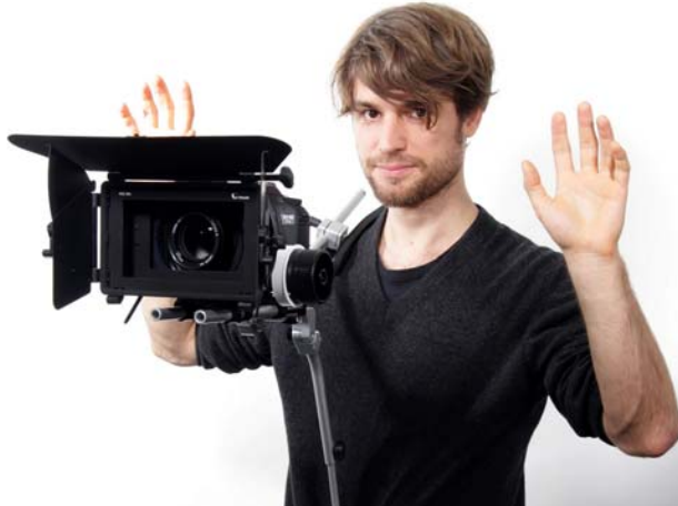
The shoulder support 3025 DV-Balancer® very easily positions the camera and the hands remain free.