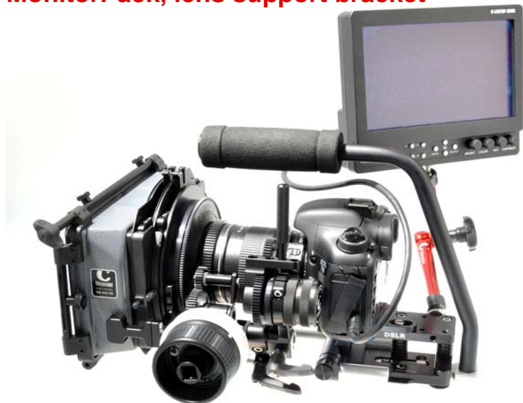
MonitorPack 550-01 mounted with 1/4" thread on light weight support with further accessories.